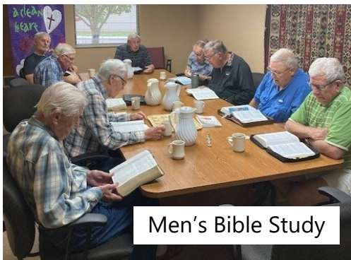
Men's Bible Study

Scan the QR code or visit www.salemdwd.org to register online!